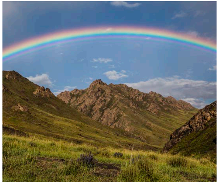
(Three Camel Lodge; L, D)

Archery: In the evening, participate in an archery lesson. Learn to fire an arrow like a Mongol warrior. You will have the opportunity to compete after mastering your new skill. This interactive experience provides fun to every age group. The lodge offers actual replicas of the bow that were used hundreds of years ago by the Mongol warriors.