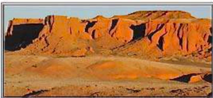
Dinosaur fossils, including the first eggs ever unearthed, were discovered near the Flaming Cliffs.

Only about 3 percent of the Gobi is covered by sand—including the Singing Sands dunes, so named for the peculiar sound made by the winds blowing over the smooth, round grains—the rest is mostly gravel plains and exposed rock. One of the most famous rock formations is the Flaming Cliffs, named by American explorer and paleontologist Roy Chapman Andrews for its vivid red sandstone cliffs. In 1923, Andrews and his team made the world's first discovery of dinosaur eggs here. Since then thousands of bones and footprints have been found in the area, including the remains of a velociraptor; organized tours