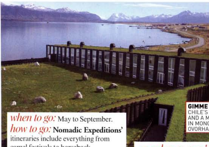
GIMME SHELTER CHILE'S REMOTA (LEFT) AND A MONASTERY IN MONGOLIA'S OVORHANGAY PROVINCE.