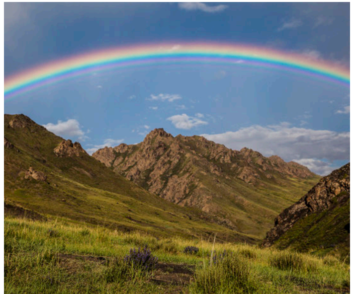
(Three Camel Lodge; L, D)

Archery: In the evening, participate in an archery lesson. Learn to fire an arrow like a Mongol warrior. You will have the opportunity to compete after mastering your new skill. This interactive experience provides fun to every age group. The lodge offers actual replicas of the bow that were used hundreds of years ago by the Mongol warriors.